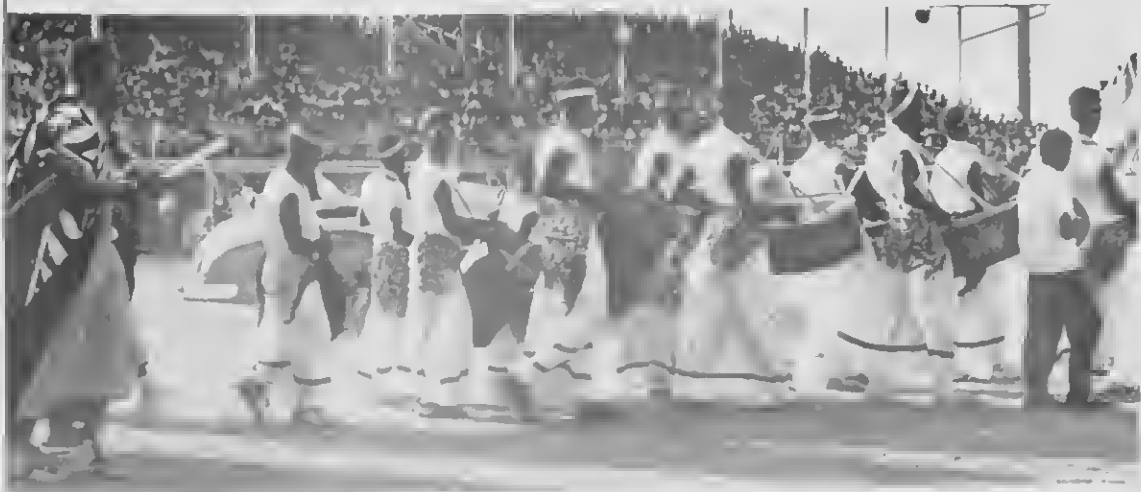
ULIUS CAESAR'S entourage included a steel band of a post-Roman era, shown here in full regalia arching, as did the gladiators, across the broad expanse of the Lago Sport Park amphitheatre. ULIUS CAESAR su grupo tabata inclui un steel band di era post-Romano, cu ta munstrá aki den impleto traje marchando mescos cu e gladiadores door di e terreno di Lago Sport Park.